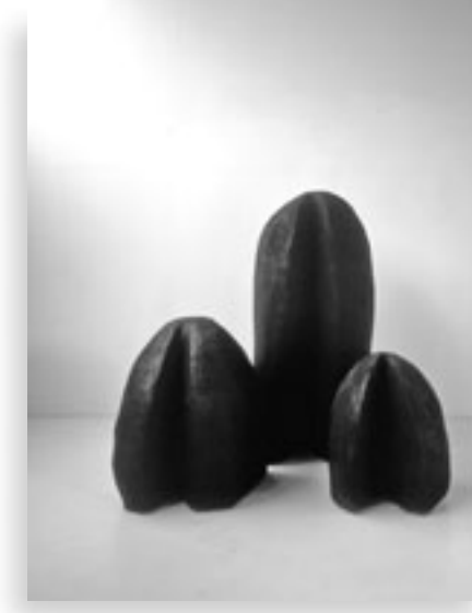
'Humps' by David Nash for Korea

2007 David was called to look at the piece as nature had taken its toll on the piece. We fabricated the wooden sculpture into Corten Steel using templates. David chose this material for the colour effect when it starts to rust, before it left the foundry we used chemicals to pre rust the piece.